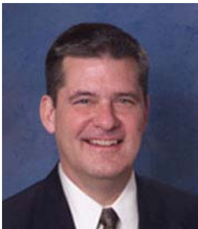
Senator Dan Rutherford

Senator Rutherford is uncontested. Visit www.danrutherford.com .