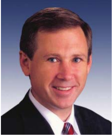
Congressman Mark Kirk

The race for Senate features Congressman Mark Kirk versus a field of heretofore unknown names. Polls show Congressman Kirk with an overwhelming lead. Several other quality candidates are worth examining in this Primary battle to see who will vie for Barack Obama's former Senate seat.